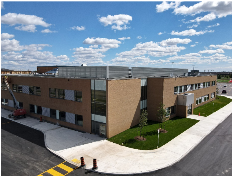
Bishop P.F. Reding CSS Classroom Addition

Construction continues on the new cafeteria and child care centre. The addition of a fourth gymnasium will commence upon the opening of the new child care centre. The conversion of the former cafeteria to an auditorium will commence upon the opening of the new cafeteria.