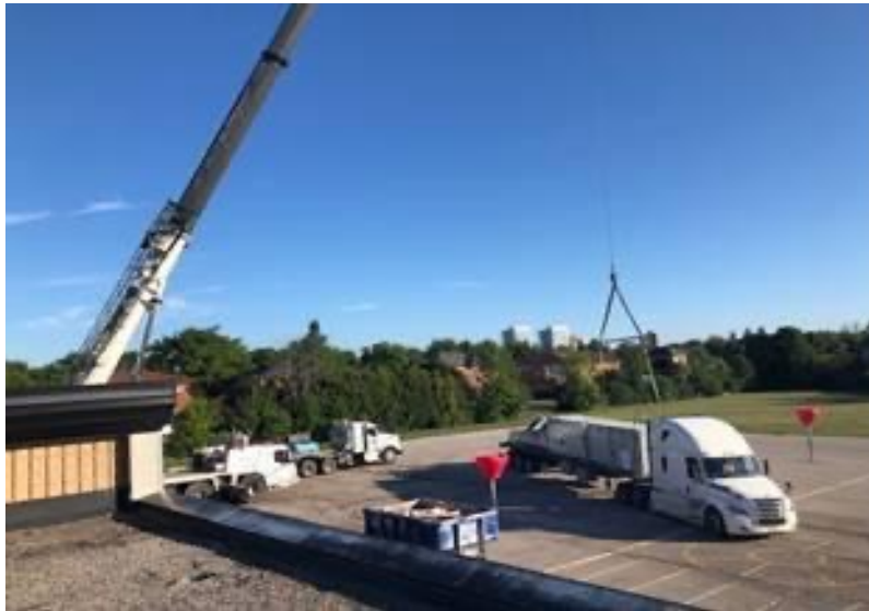
Rooftop Unit Installation at Thomas Merton Centre (Oakville)

The former St. James School was retrofitted to be the new home for the Thomas Merton Centre in Oakville. The interior space was reconfigured to accommodate the various programs at the centre. All new mechanical and lighting systems were also installed as part of the project.