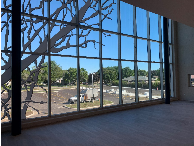
View from Library Addition at Assumption CSS

The classroom, library and cafeteria addition at Assumption CSS opened to students and staff on September 9, 2020. The new addition also includes a large student forum, washrooms and an elevator. New terraces at the front and rear of the school were also added as part of the project.