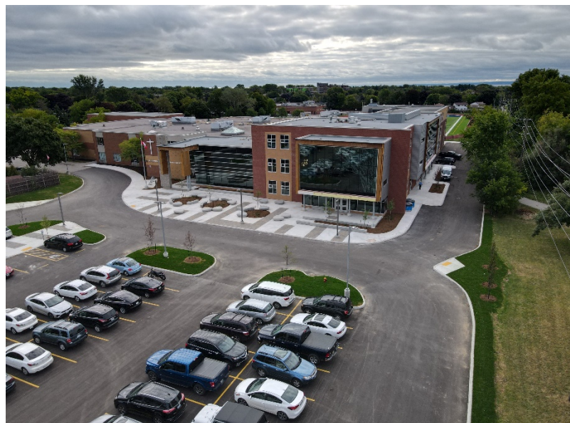
Completed Landscaping at the Front of Assumption CSS