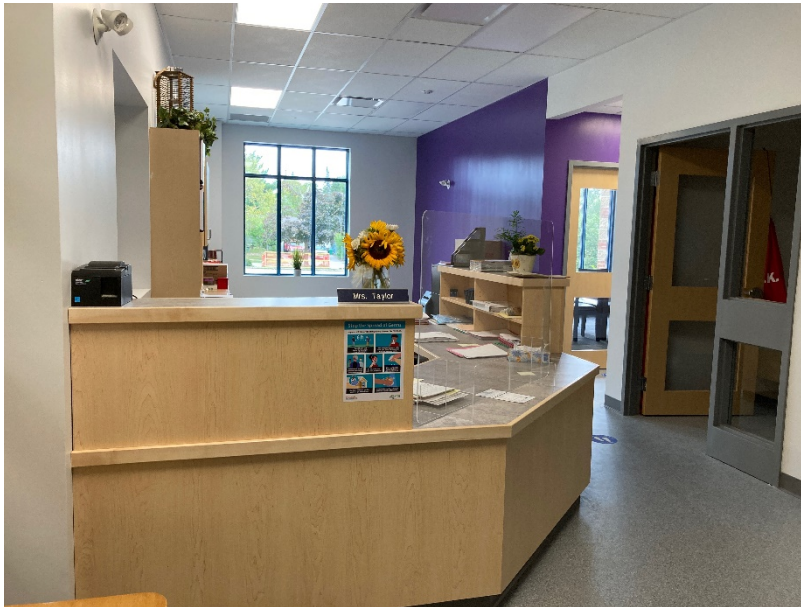
Main Office at St. Michael CES