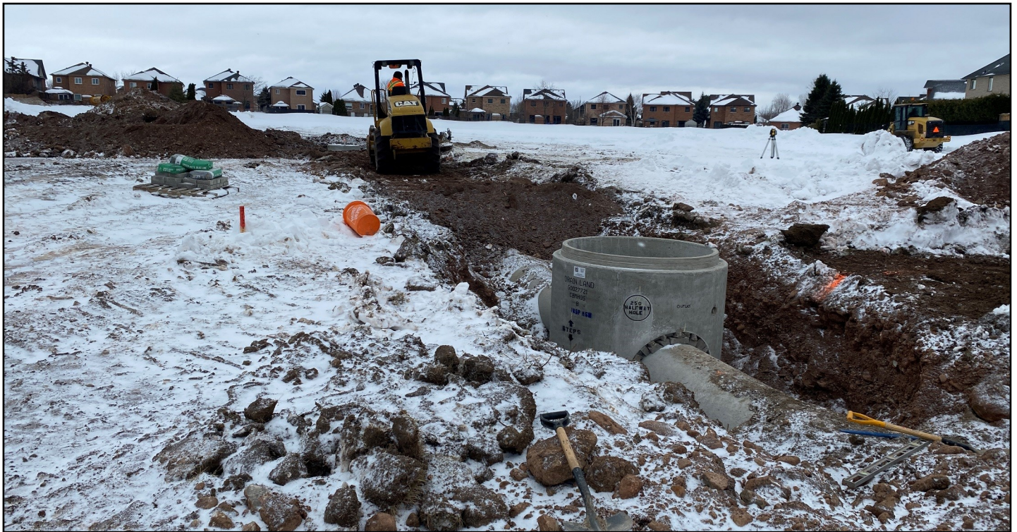
Installation of site services underway.