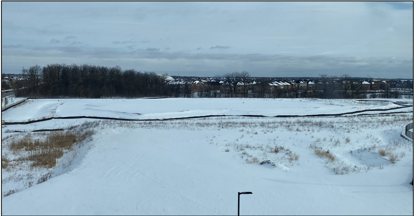
Building site pad.